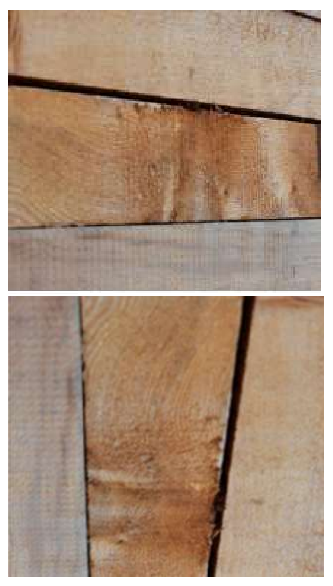
Figure 1 Modinex Group Screening & Square Dressed

The https://www.modinex.com.au/ site offers more information.