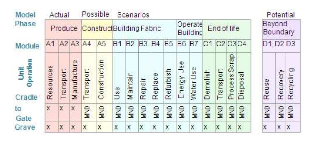
Figure 2 Phases and Stages Cradle to Grave