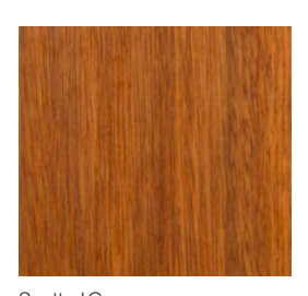
Spotted Gum FSC Certification is available