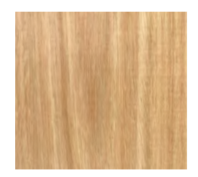
Blackbutt FSC Certification is available

Hardwood\,species\,can\,be\,used\,for\,15mm\,thickness\,or\,greater\,for\,out\,of\,weather\,applications\,and\,18mm\,thickness\,or\,greater\,for\,external\,use.