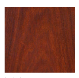
Ironbark FSC Certification is available