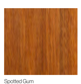
FSC Certification is available