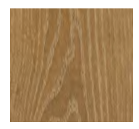
French Oak PEFC Certification is available