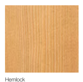
Plantation 100% PEFC Certified Suitable for indoor and out-of weather use only