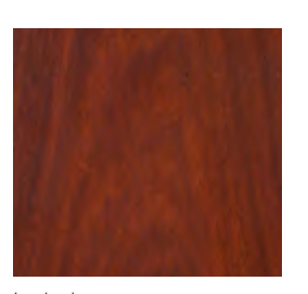
Ironbark FSC Certification is available