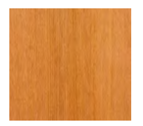
Western Red Cedar Plantation 100% PEFC Certified Greentag Certified

Western Red Cedar, Alaskan Cedar & Hemlock are the only suitable species for 9mm thick profiles. All Softwood species can be used for 12mm thickness or greater. For external applications, please use 18mm thick profiles or greater.