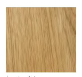
American Oak PEFC Certification is available

Hardwood species can be used for 15mm thickness or greater for out of weather applications and 18mm thickness or greater for external use.