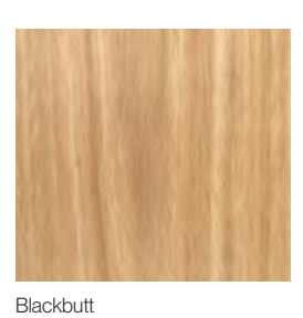
FSC Certification is available