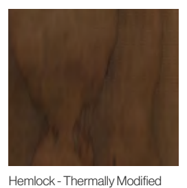
Plantation 100% PEFC Certified