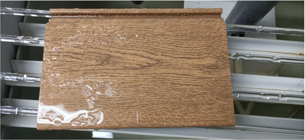
Sample After Salt Spray Test.